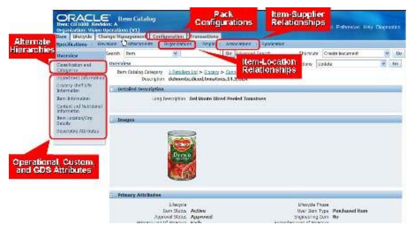
Figure 3. Key product information captured in Oracle Product Hub